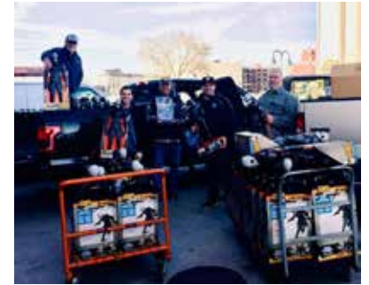
Reno Aces and Reno 1868 FC Donate New Toys to the Reno Rodeo Foundation