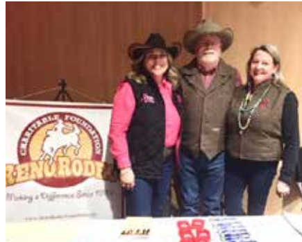
Reno Rodeo Family Shares Great Work at YPN Nonprofit Event

annual YPN Nonprofit event. There were so many wonderful people interested in learning more about the Reno Rodeo Family. YPN members were enthusiastic about becoming involved and were motivated to understand how thousands of children with extraordinary needs benefit from the talented and dedicated Reno Rodeo Volunteers.