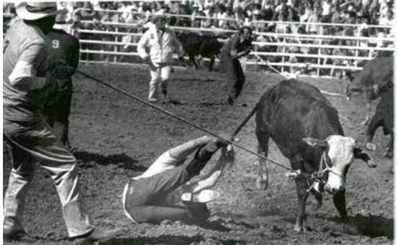
Teams hold on for dear life in the 1979 businessmen's steer decorating contest.

Businesses were also encouraged to sponsor teams for the annual Businessman's Steer Decorating Contest. This event consisted of two-man teams. One was responsible for holding