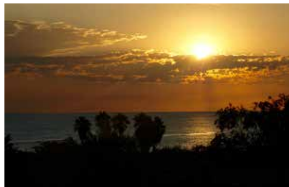
Sunrise on the Sea of Cortez from the main patio.

Casa Sacacorchos is the Mexico home of Marjie and Bob Swiatek and is located about an hour north of the Cabo airport on the Sea of Cortez side of Baja. The home has four bedrooms, four bathrooms, a pool with a swim up bar, and incredible views of the Sea of Cortez and surrounding areas. It's a great place to relax and enjoy the area.