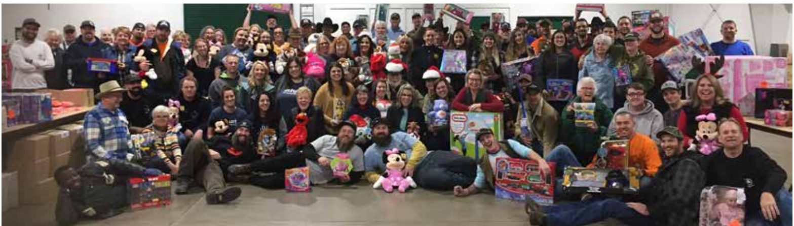
100 Volunteers helped with the 2018 RRF Toy Distribution Event