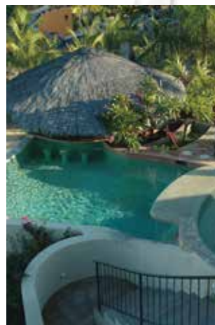
View of the swim up bar from the roof top patio