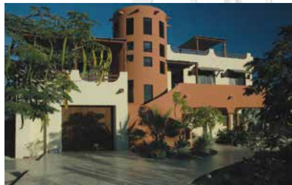
Casa Sacacorchos from the front driveway.