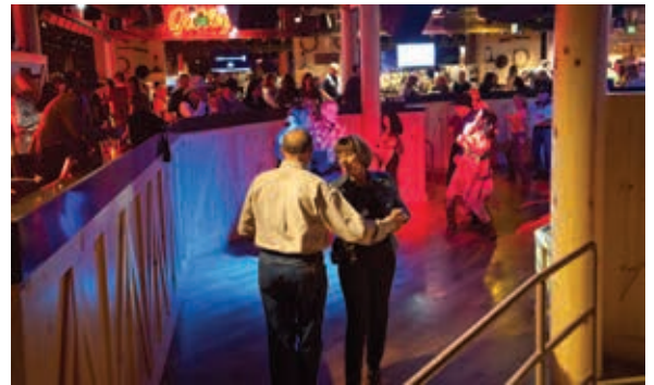
The crowd at Gilley's.