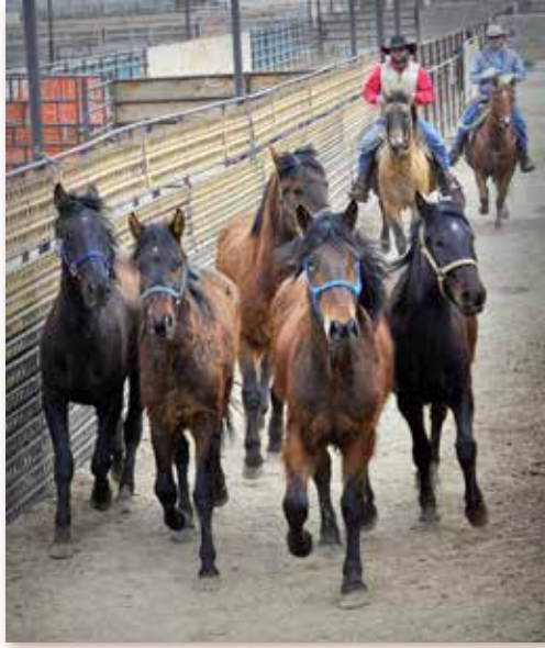
Wild horses that were selected and haltered for five trainers, traveled together from Oregon

It's unlikely that you haven't heard that The Extreme Mustang Makeover will return to the Reno Rodeo as a Special Day Event on June 18-19, 2016. Through a partnership with the Bureau of Land Management's Wild Horse and Burro Program, the Mustang Heritage Foundation created the Extreme Mustang Makeover in order to recognize and highlight the value of Mustangs through a national training competition.