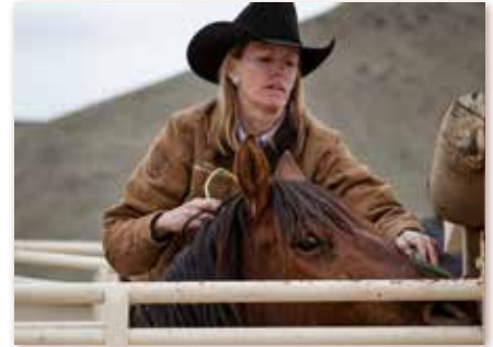
A BLM employee, and a long-time Reno Rodeo Association Member halter a wild horse, for the first time.

SEE YOU AT WORK DAY, JUNE 11, STARTING AT 8 AM!